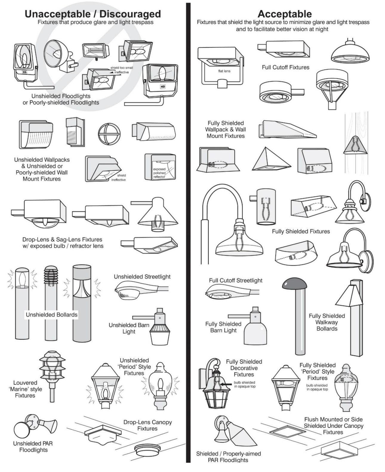
Figure 2: Examples of lighting that emits no direct uplight and reduces light pollution

Fully shielded lights are constructed and installed in such a manner that all light emitted by the luminaire, either directly from the lamp or a diffusing element, or indirectly by reflection or refraction from any part of the luminaire, is projected below the horizontal plane through the luminaire's lowest light-emitting part.