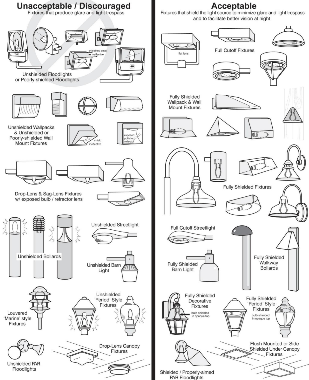
Figure 2: Examples of lighting that emits no direct uplight and reduces light pollution

Fully shielded lights are constructed and installed in such a manner that all light emitted by the luminaire, either directly from the lamp or a diffusing element, or indirectly by reflection or refraction from any part of the luminaire, is projected below the horizontal plane through the luminaire's lowest light-emitting part.