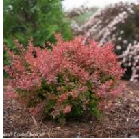
Barberry has great fall color

Conserve water with drought tolerant plants. Xeriscape gardening is beautiful and cost effective. Here are a few shrubs and trees that need little water once established.