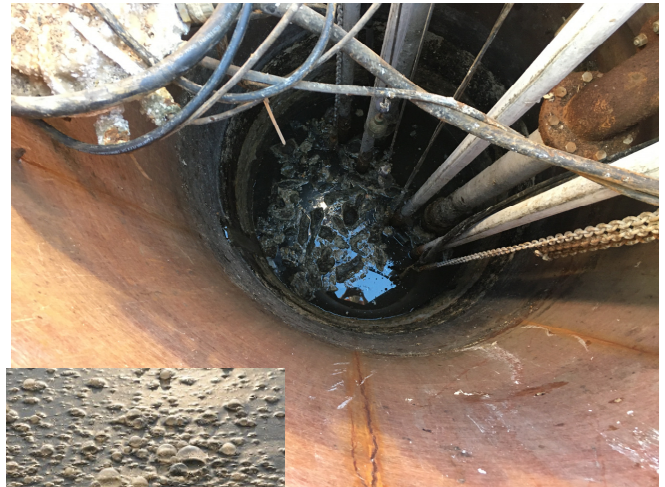
(above) Grease in a Cascade lift station on August 11, 2020.